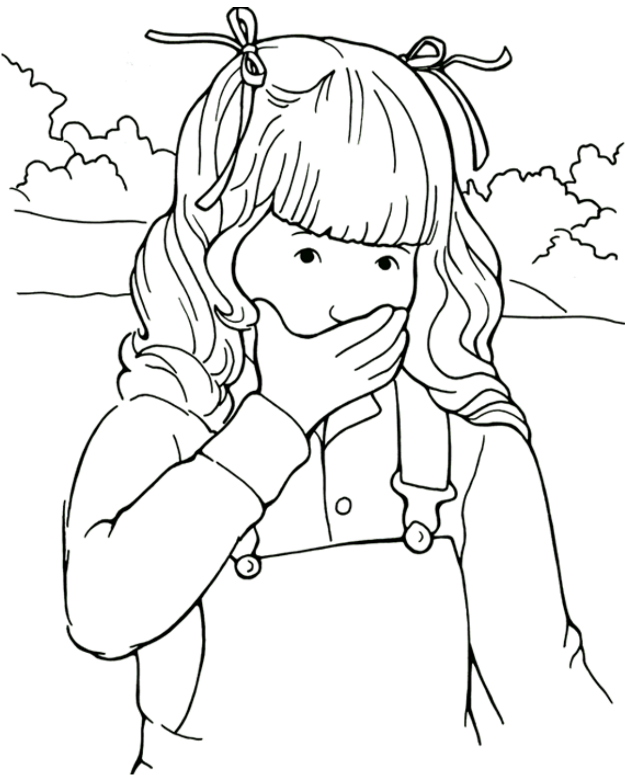
"Lord, help me control my tongue. Help me to be careful what I say."

From Thru-the-Bible Coloring Pages for Ages 4-8. © 1986,1988 Standard Publishing. Used by permission. Reproducible Coloring Books may be purchased from Standard Publishing, www.standardpub.com, 1-800-323-7543.