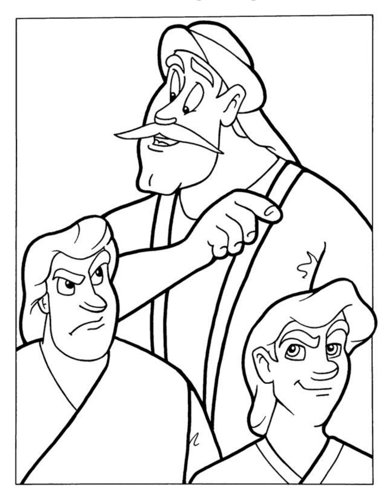
The Parable of the Two Sons