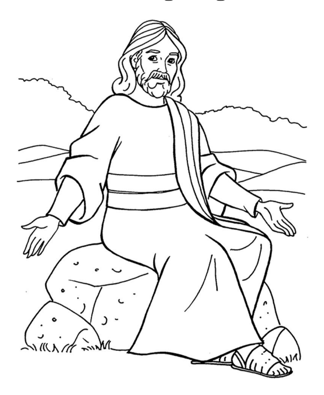
The Parable of the Weeds