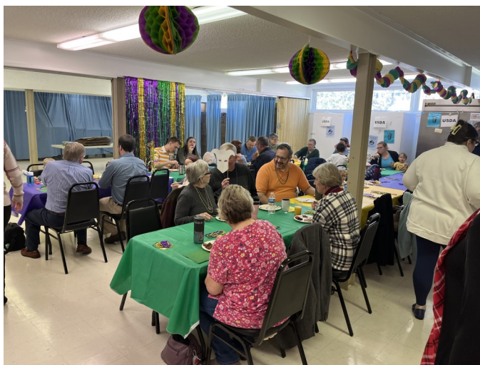
Fat Tuesday Pancake Brunch

Year to date (through Feb 28th), we have received $28,693.98 for the General Fund and have had $47,721.03 in expenses from the General Fund. The balance (as of Feb 28th) is $49,819.82.