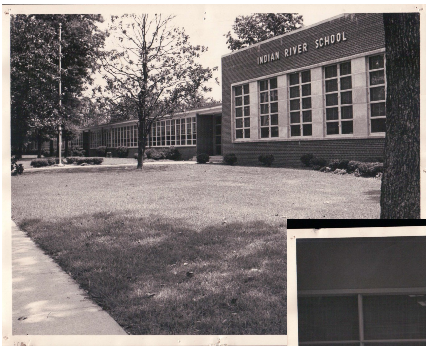
These pictures are from the first worship service, which was held at Indian River Elementary School in April of 1963.