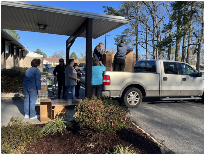
Food Pantry volunteers unloading