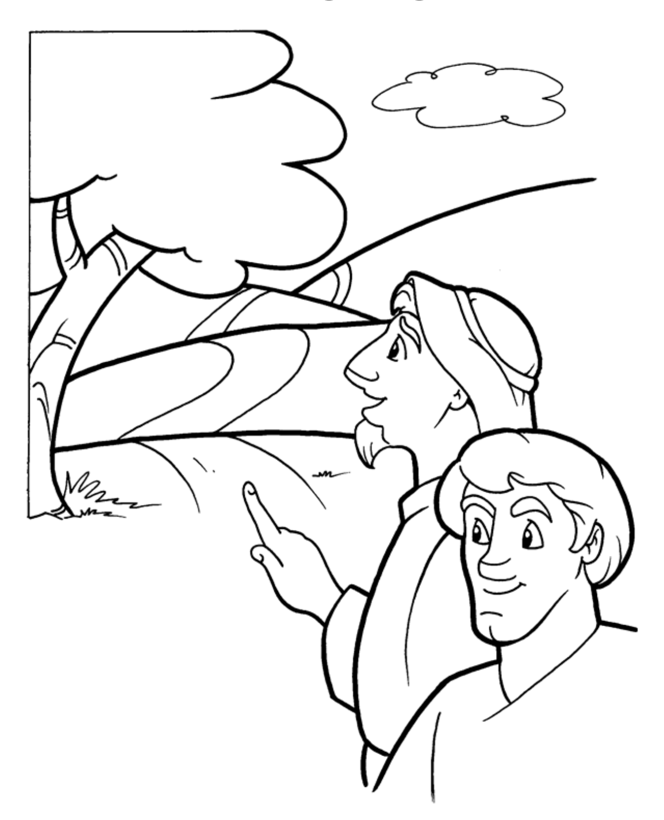
The Road to Emmaus