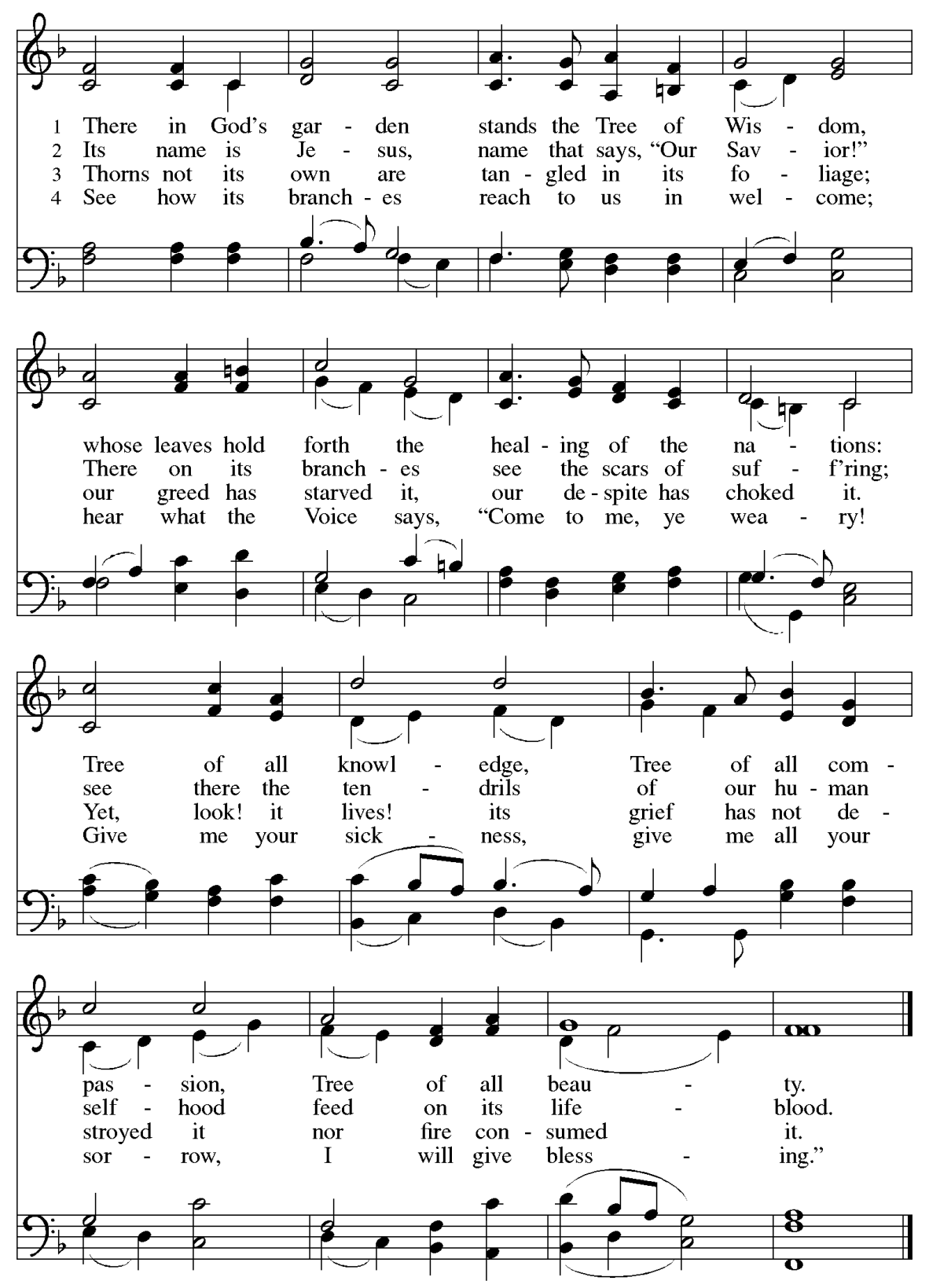
verses 5 & 6 on next page