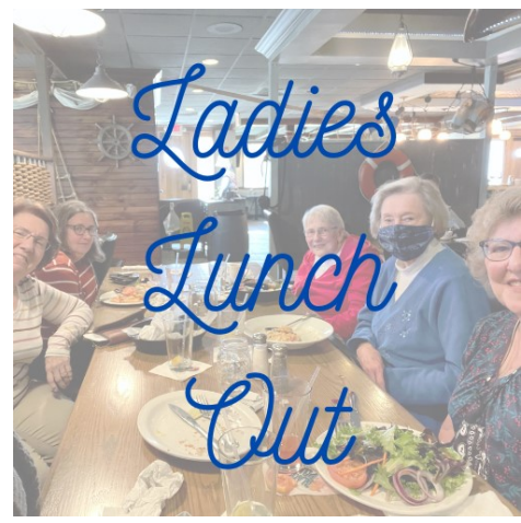
Ladies Lunch Out Wednesday, April 19th at Noon at Red Robin (1024 Eden Way N, Chesapeake, VA 23320) Join the ladies of GLC for fellowship & food. Please sign up in the Narthex by Sunday, April 16th.

Join via phone by calling 646-558-8656 and entering the Meeting ID: 859 6443 0976 and Passcode: 040561.