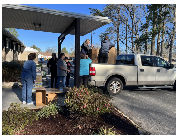
Food Pantry volunteers unloading